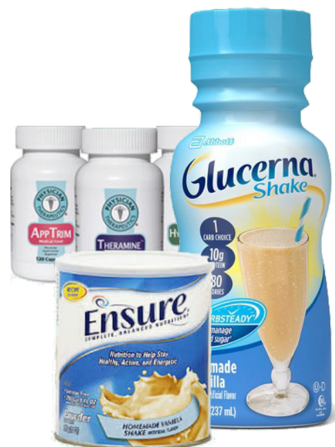
Examples of Medical Foods