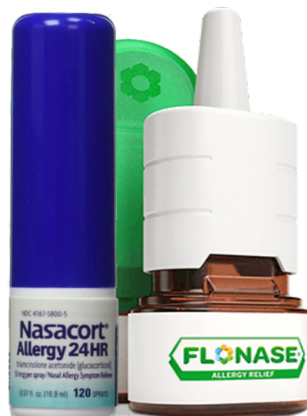
Examples of Intranasal Corticosteroids

For more information, please refer to the 2015 Health Plan Summary Plan Description booklet under Article V, "Prescription Drug Benefits." PH